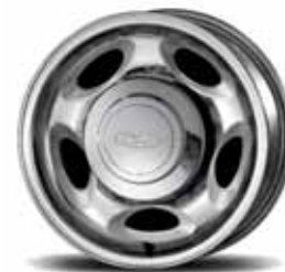
16" Aluminum Available