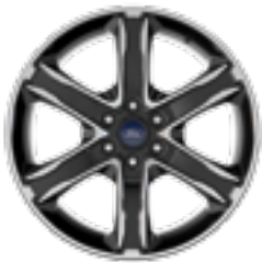
22" PREMIUM BLACK-PAINTED ALUMINUM Included with Stealth Edition Package (303A)