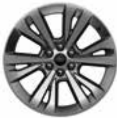
22" 6-SPOKE PAINTED MACHINED-FACE ALUMINUM WITH DARK TARNISH-PAINTED POCKETS Included with 302A

Available equipment shown. 1 Additional charge. 2 Metallic. 3 Certain restrictions, 3rd-party terms and data rates may apply. See footnote 1 on the “Your Tech, Your Way” pages, and your Ford Dealer for details. 4 Ford Licensed Accessory.