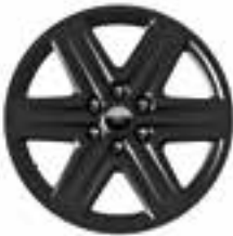
20" 6-SPOKE GLOSS BLACK-PAINTED ALUMINUM Included

2nd-row 40/20/40 split-fold seats with CenterSlide ® and manual recline (201A or 202A with Black Accent Package) 4-wheel drive (4WD) (includes 1-speed transfer case, Terrain Management System ™ , Hill Descent Control and front tow hooks) Floor liners for 1st and 2nd rows Power, panoramic Vista Roof ® with power sunshade (requires 201A or 202A) Reversible cargo mat Voice-activated Navigation System with pinch-to-zoom capability (includes SiriusXM ® Traffic and Travel Link ® with 5-year subscription 2 ) (requires 202A on XLT)