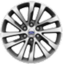
20" PREMIUM DARK TARNISH-PAINTED ALUMINUM Standard