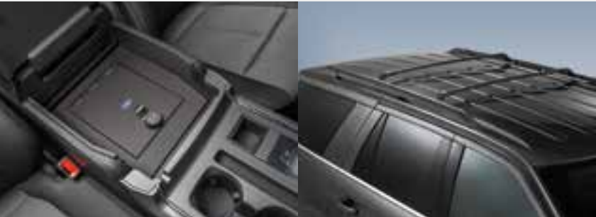
In-vehicle safe 1