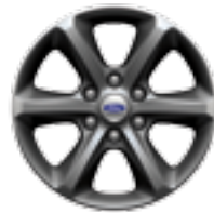
18" MAGNETIC-PAINTED CAST-ALUMINUM Standard

2nd-row power-folding tip-and-slide captain's chairs (requires 201A and 202A on XLT) Dual-Headrest Rear Seat Entertainment System 3 (requires 201A or 202A on XLT) Power, panoramic Vista Roof with power sunshade (standard on Limited 301A; requires 201A or 202A on XLT) Reversible cargo mat Voice-Activated Touchscreen Navigation System with pinch-to-zoom capability (includes SiriusXM Traffic and Travel Link with 5-year subscription 1 ) (standard on Limited 301A; requires 202A on XLT)