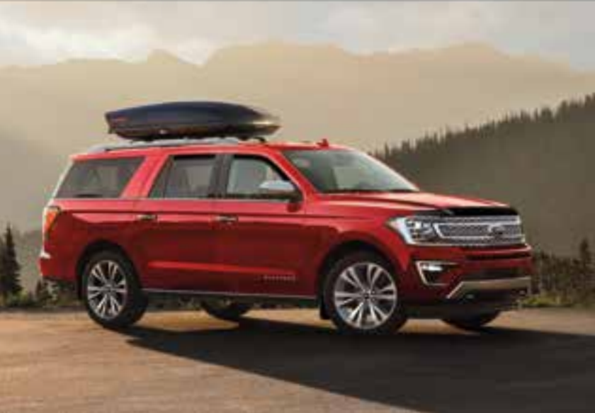
Expedition MAX Platinum in Rapid Red Metallic Tinted Clearcoat accessorized with hood deflector, side window deflectors, 1 splash guards, 1 roof crossbars, and roof-mounted cargo box 1,2